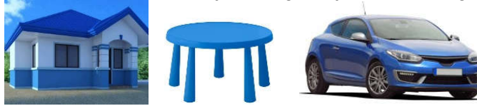
Figure 3 – three different objects recognized just as “blue things”

However, in the lack of any semantics, ML algorithm sees these different objects are just “blue things”.